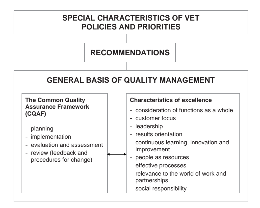
Chart 1. Structure of the Quality Management Recommendation

Alongside recommendations, the document also sets out specifications and examples intended to help VET providers to put the recommendations into action. The examples are indicative and do not cover all forms and situations of vocational education and training.